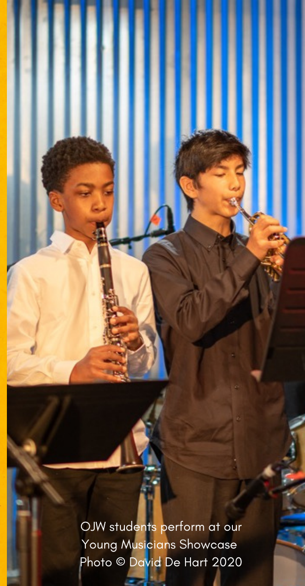
OJW students perform at our Young Musicians Showcase